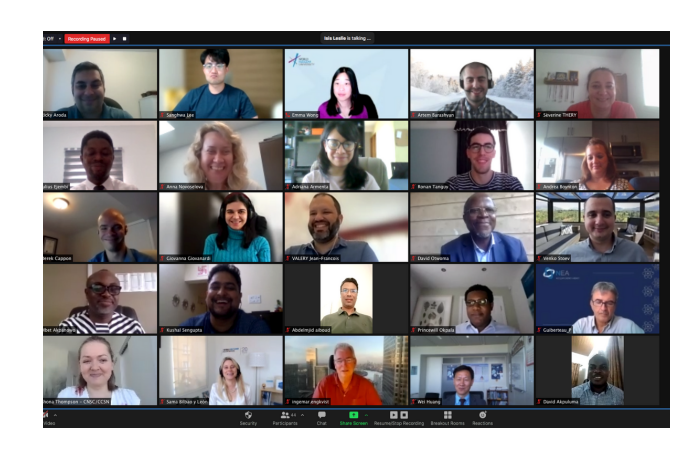
SLA 2021 Fellows

Over 40 industry-leading speakers presented to the fellows including representatives from: IAEA, EPRI, OPG, FORATOM, EDF, INL, among others.